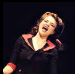
Guys & Dolls (2013)