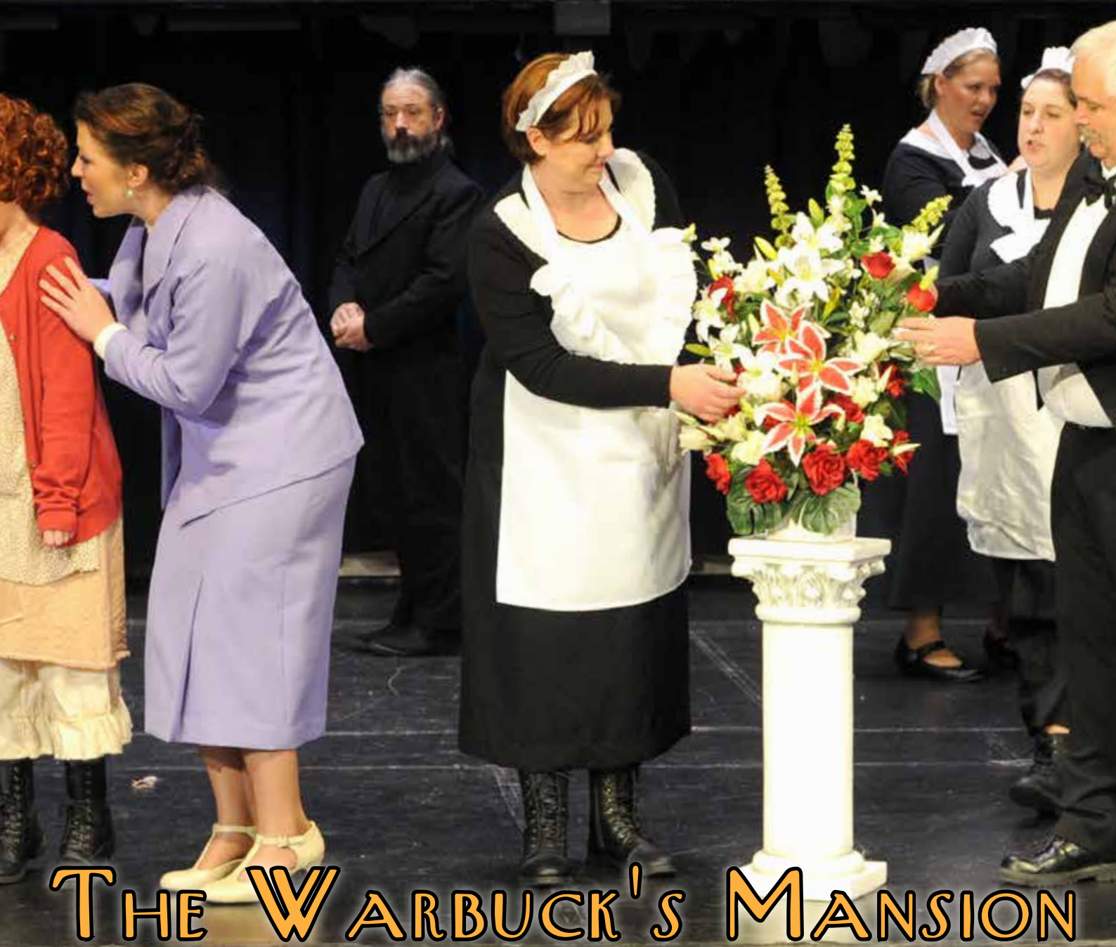
THE WARBUCK'S MANSION