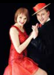
Modern Millie (2015)

We would be glad to take them off your hands!! Who knows, you might see them in all their glory in our next production.